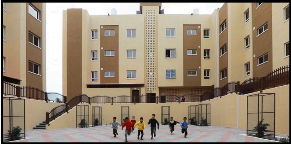
Al Nada Neighborhood Upon Project Completion (2022)

Additionally, work continues on the Central Desalination Plant in the Gaza Strip, a project funded by a World Bank trust fund with an Italian contribution of 8 million euros. This facility is essential for providing potable water to Gaza's population.