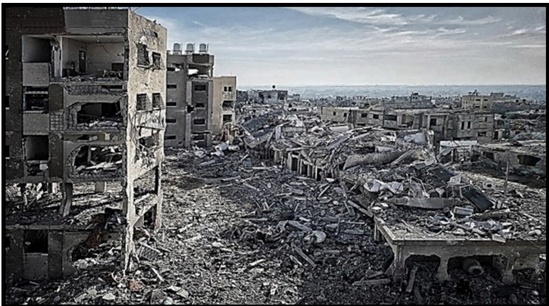
Al Nada Neighborhood Devastated by the war (October 2023)

https://www.youtube.com/watch?v=0Wb03tvW05Y&t=18s&ab_channel=AICSJerusalem